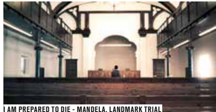
I AM PREPARED TO DIE - MANDELA, LANDMARK TRIAL