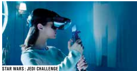
STAR WARS : JEDI CHALLENGE